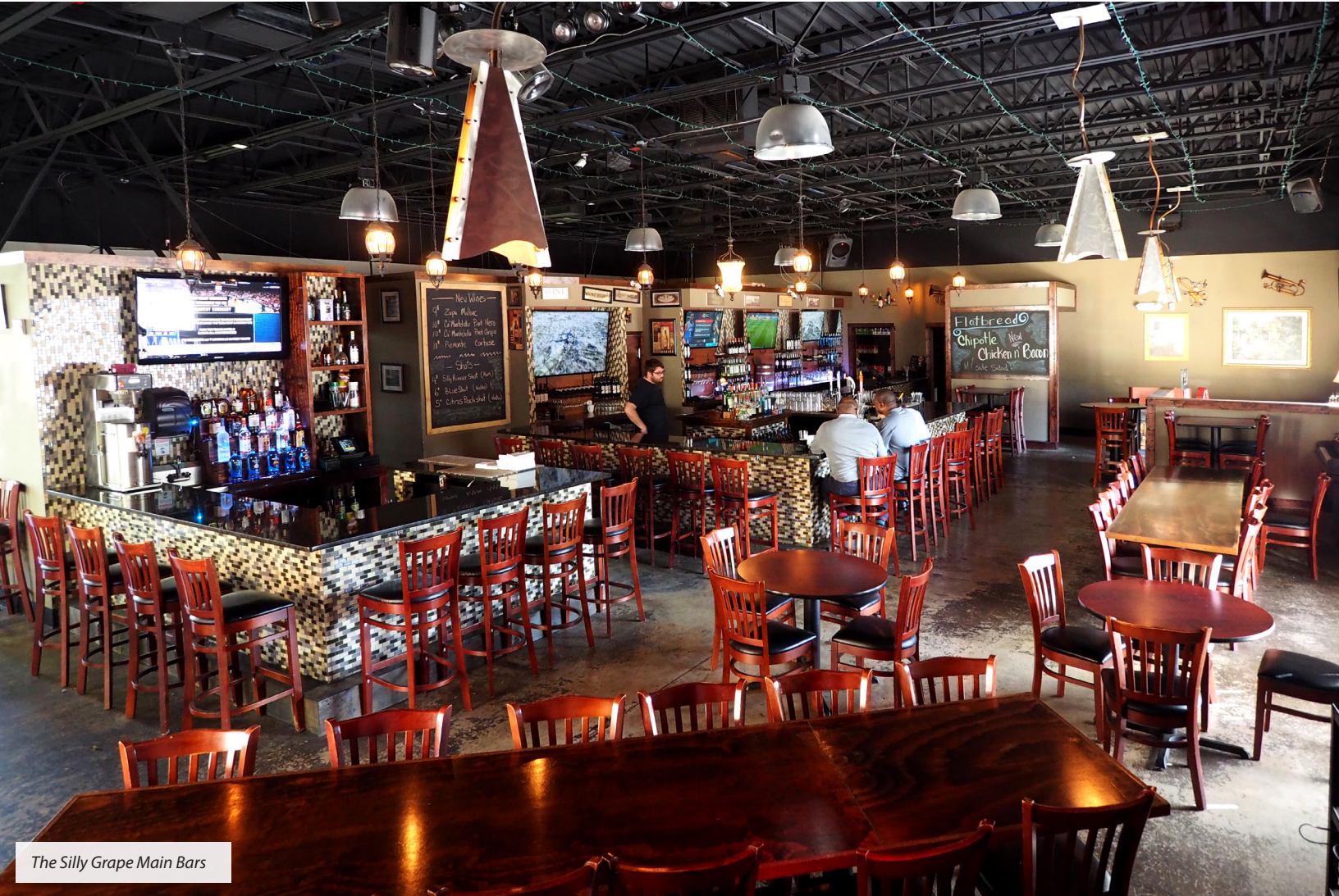
The Silly Grape Main Bars