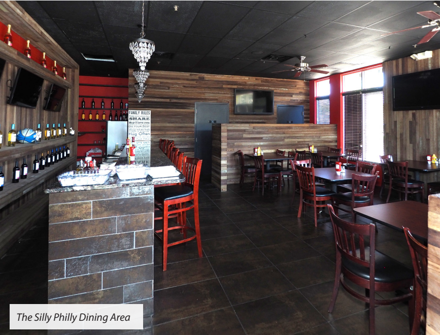
The Silly Philly Dining Area