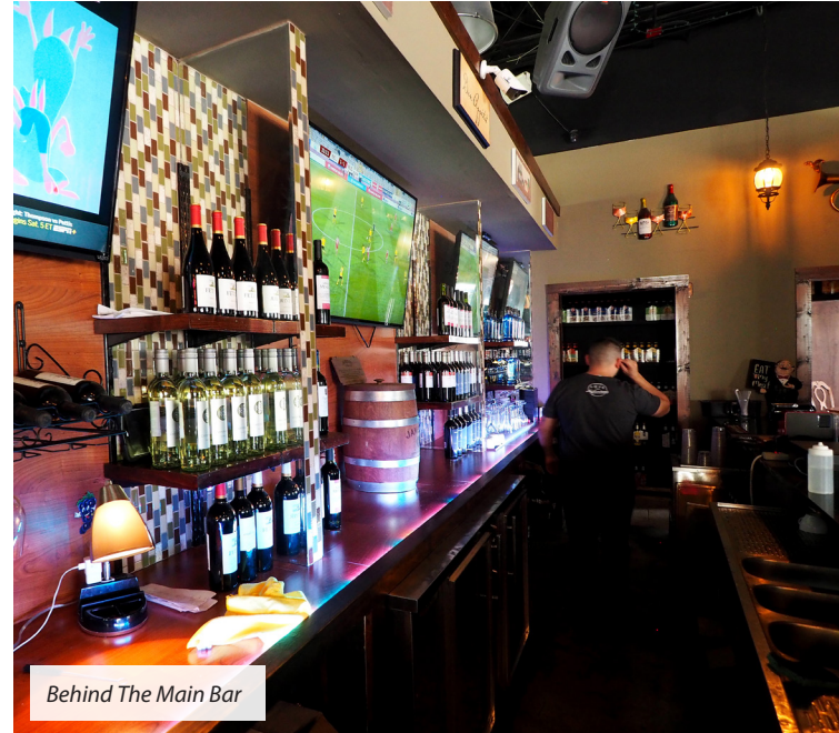
Behind The Main Bar