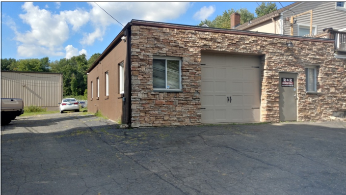
Garage 2000 S/F