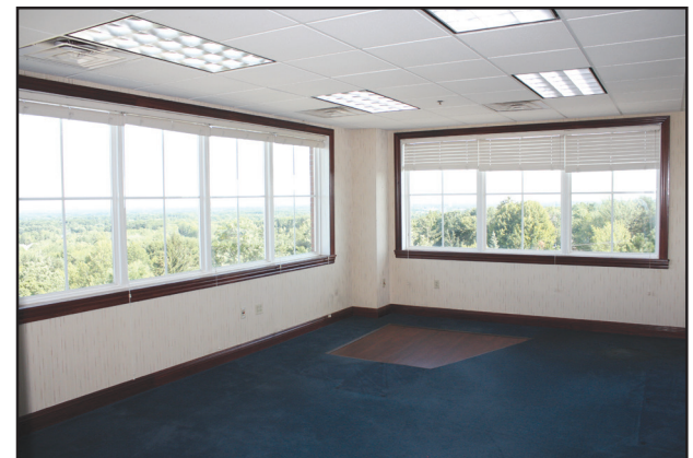
Office with a great view!