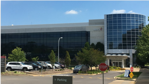
Physician's Office Center