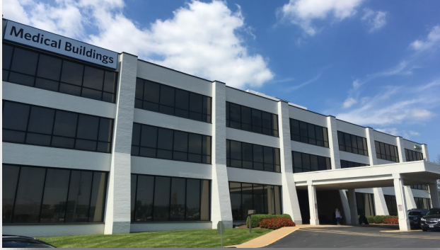
Medical Office Buildings A & B