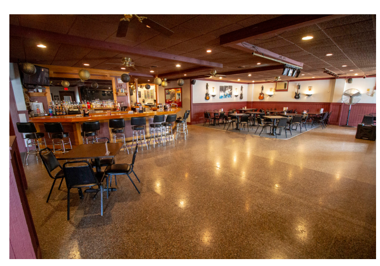
BAR & DANCE FLOOR