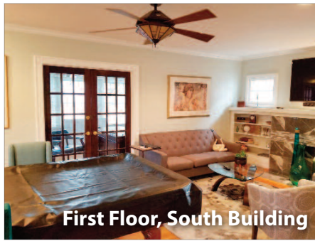
First Floor, South Building