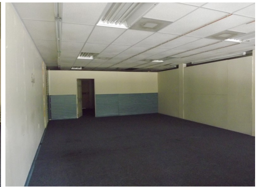
Unit # 8 & 9 - 1,900 SF

Chas Lawrence / clawrence@cbcbenchmark.com / Direct: (904) 421-8528