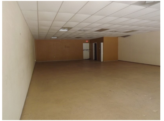
Unit #2 - 1,500 SF