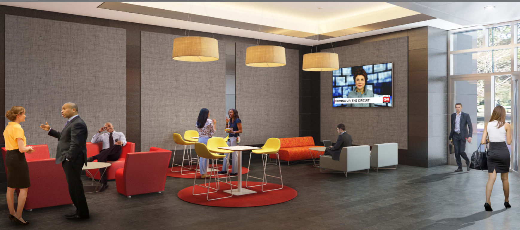
FIRST-CLASS LOBBY with concierge services, new tenant lounge, large screen TV and Wi-Fi.