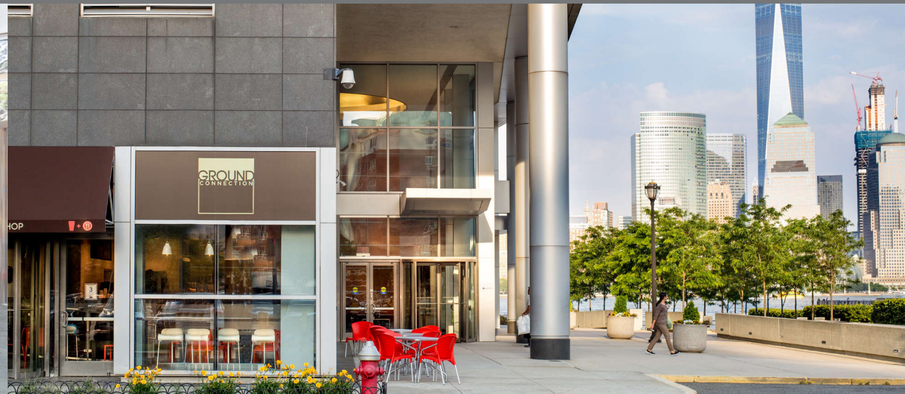
Outdoor seating with WATERFRONT VIEWS and direct access to the Hudson River Walkway.