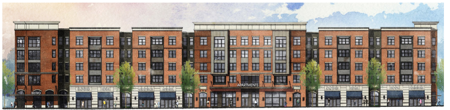
N. HIGH STREET ELEVATION (WEST)