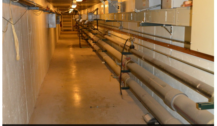
TUNNELS FOR CHILLED WATER & POWER