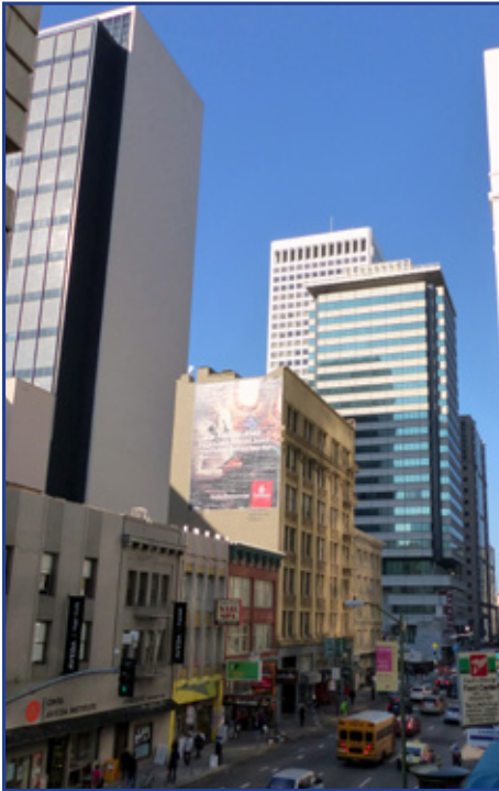
Kearney St View