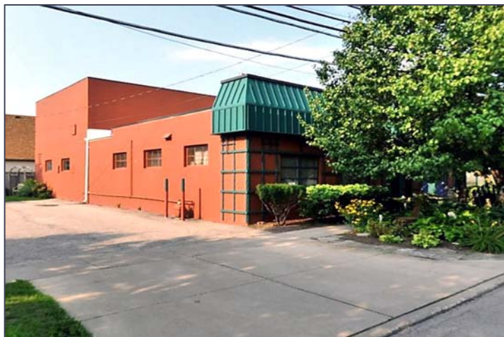
Side of warehouse