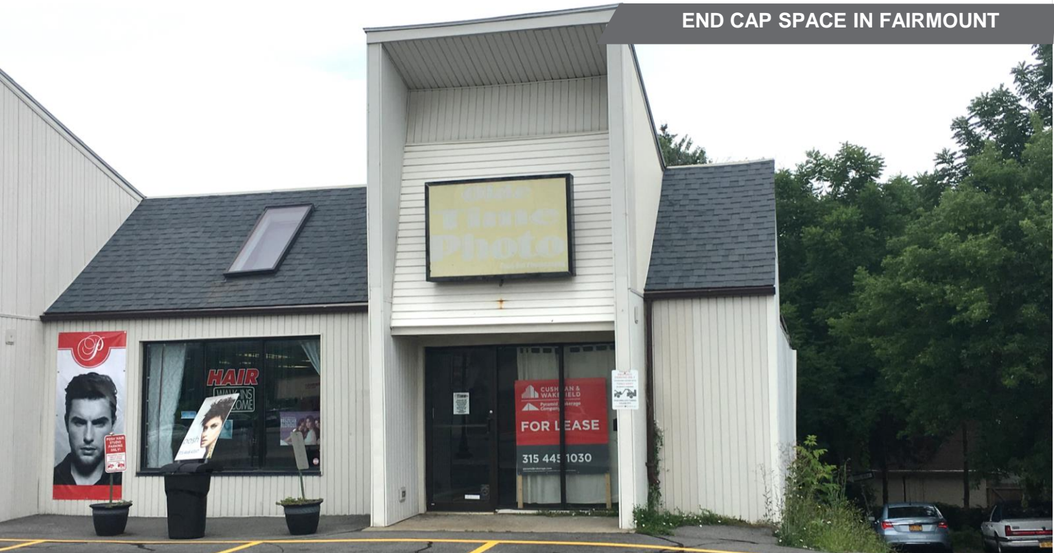
END CAP SPACE IN FAIRMOUNT