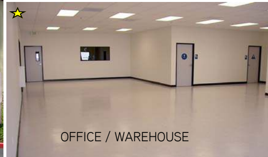
OFFICE / WAREHOUSE