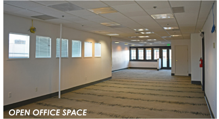
OPEN OFFICE SPACE