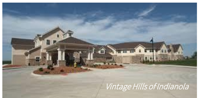
Vintage Hills of Indianola