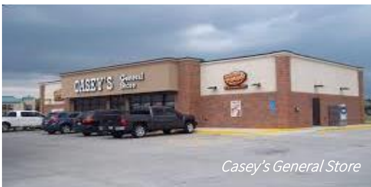
Casey's General Store

Indianola is also noted for its great public schools, Simpson College, the Des Moines Metro Opera and the National Balloon Classic. Simpson College is a private college founded in 1860 with about 2,000 students. The Des Moines Metro Opera was founded in 1973, performs every summer and has been called a national treasure. The National Balloon Classic is the nation's second oldest and second longest hot-air balloon event in the United States.