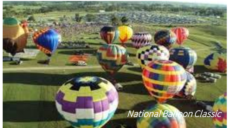
National Balloon Classic