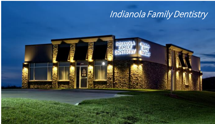
Indianola Family Dentistry