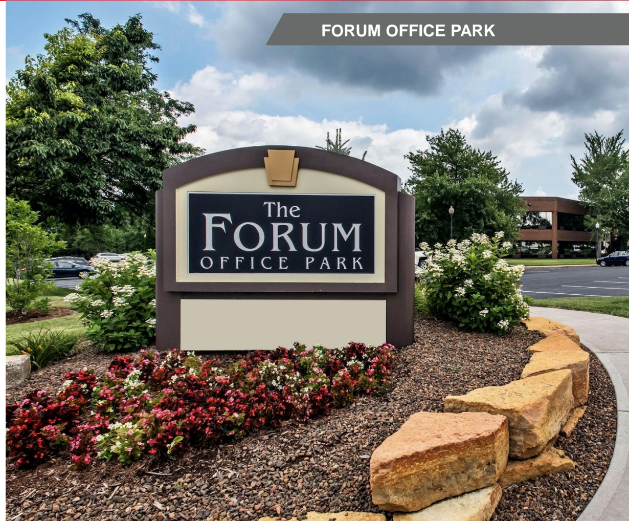
FORUM OFFICE PARK