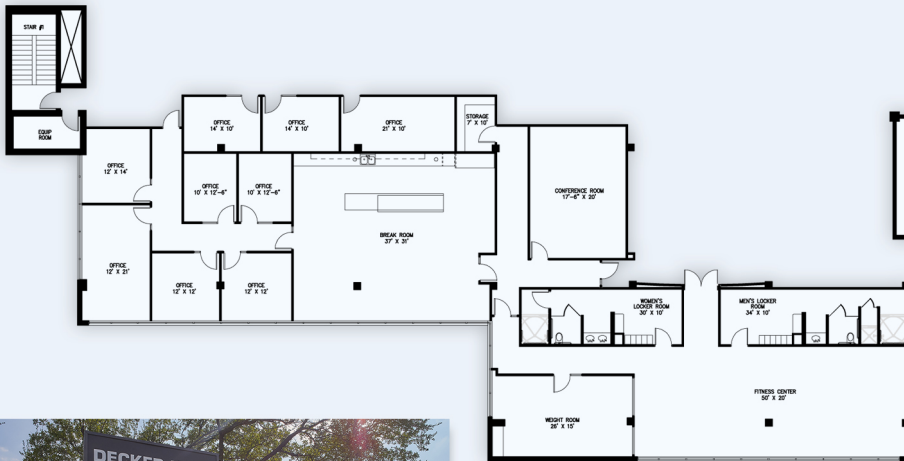
Suite 325 & 350 7,296 RSF