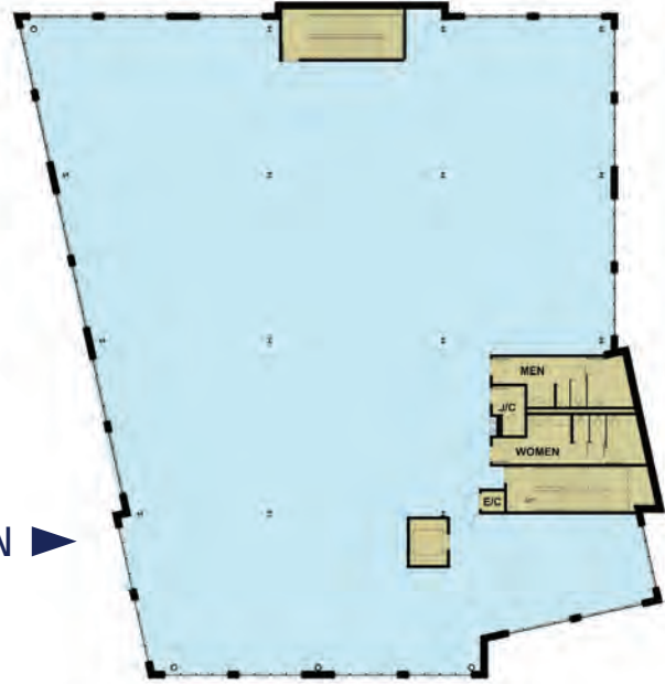
TYPICAL FLOOR PLAN ▶