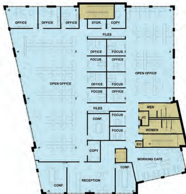
◀ TYPICAL FLOOR PLAN