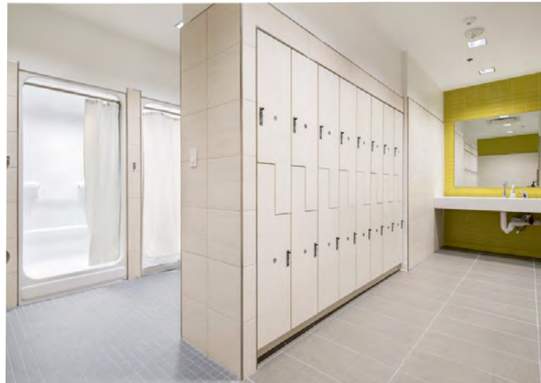
Top, left, right: Fitness center, fountain in lobby, showers and lockers in fitness center