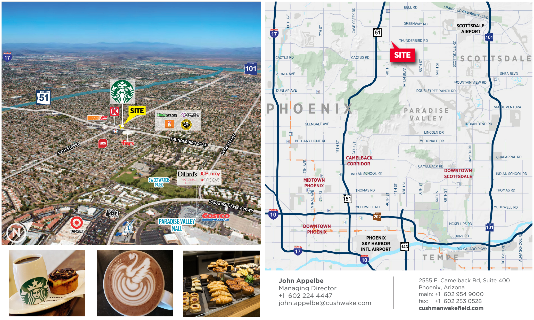
©2019 Cushman & Wakefield. All rights reserved. The information contained in this communication is strictly confidential. This information has been obtained from sources believed to be reliable but has not been verified. No warranty or representation, express or implied, is made as to the condition of the property (or properties) referenced herein on as to the accuracy or completeness of the information contained herein, and same is submitted subject to errors, omissions, change of price, rental or other conditions, withdrawal without notice, and to any special listing conditions imposed by the property owner(s). Any projections, opinions or estimates are subject to uncertainty and do not signify current or future property performance.