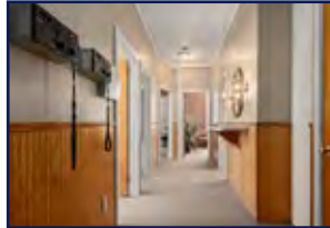
950 Tunnel Road Hallway