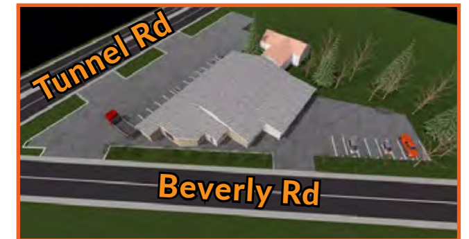
Top: Floorplan showing all four spaces with lot-line inset - Two suites are currently available For Lease