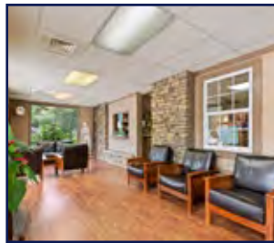
944 waiting room