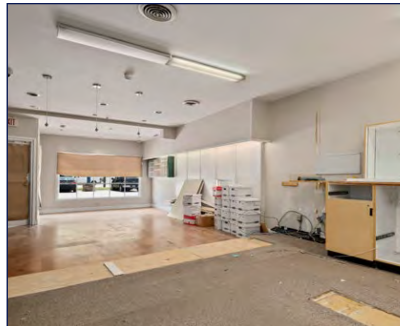
948 Tunnel Road - front area