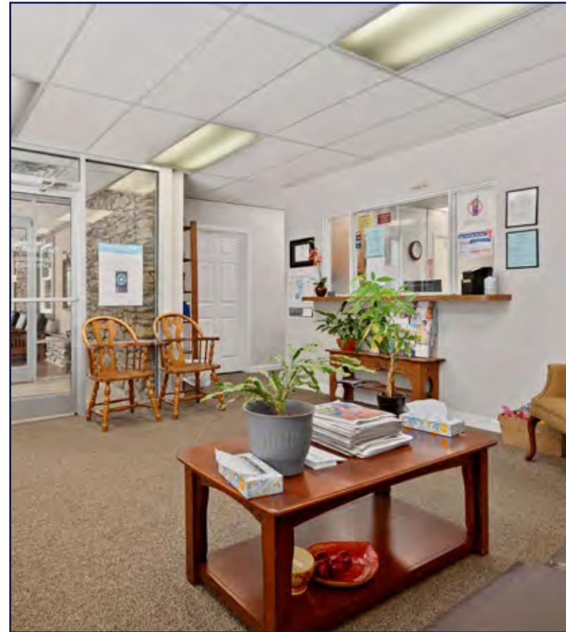
946 Tunnel Road - waiting room

PARKING: 33 TRAFFIC COUNTS: 18,000 VPD ADDITIONAL FEATURES: SOME FIXTURES