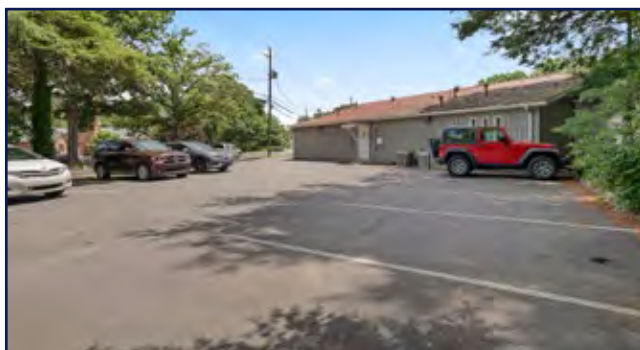
Back parking lot; front and back combined total 33 spaces