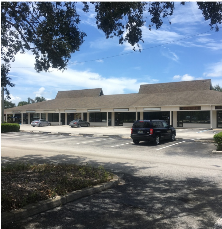
Plantation Plaza 6600 20th St, Vero Beach, FL 32966