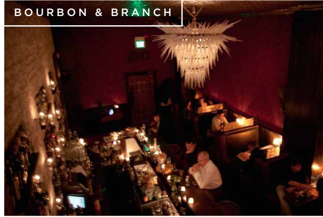
BOURBON & BRANCH