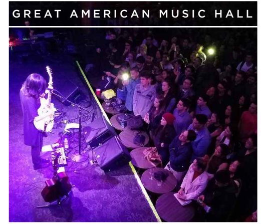
GREAT AMERICAN MUSIC HALL