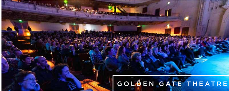
GOLDEN GATE THEATRE