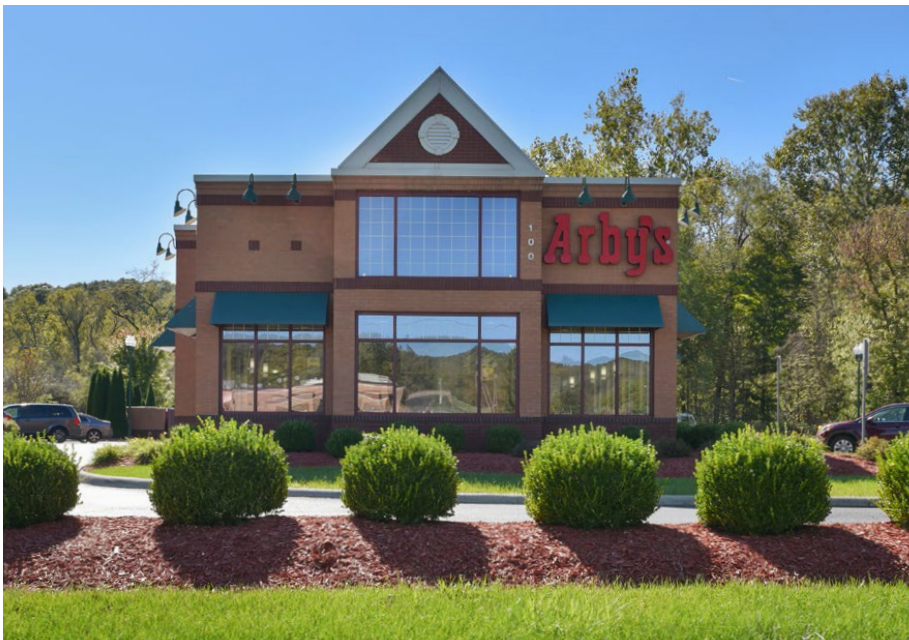
100 Speedway Dr | Newark, OH