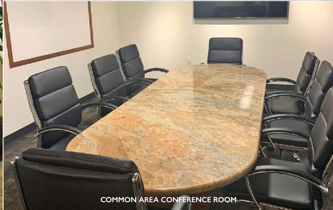
COMMON AREA CONFERENCE ROOM