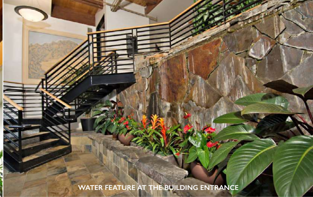
WATER FEATURE AT THE BUILDING ENTRANCE