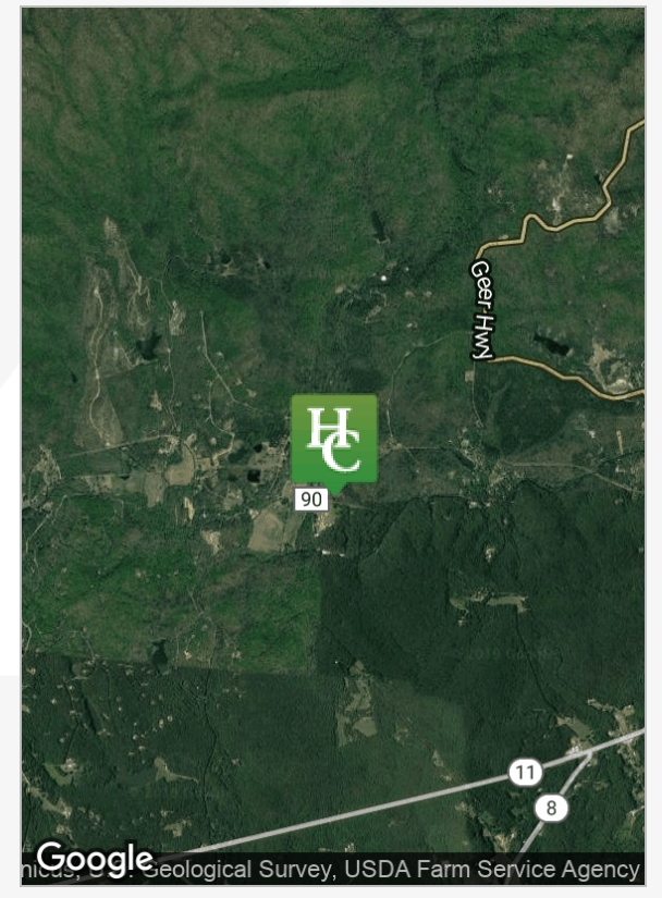
For more information

This 13.8+/- acre parcel is located approximately 1.5 miles east of the Table Rock reservoir in the Cleveland community of northern Greenville County. The property has good elevation and views with some excellent potential homesites as well. A small field complements the mostly wooded tract and an old roadbed is in place as well. In addition public water and power are both available.