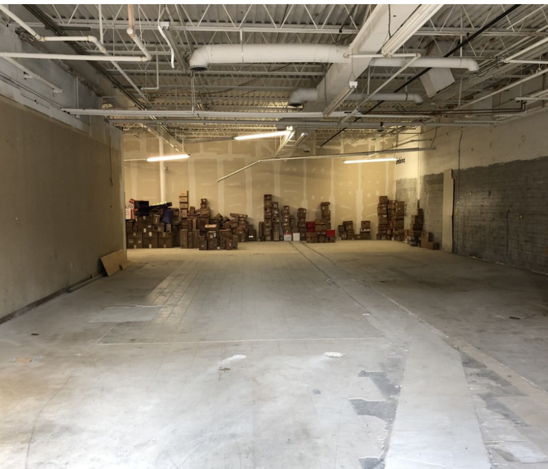
SUITE 3 - 11' 8" Ceiling Height