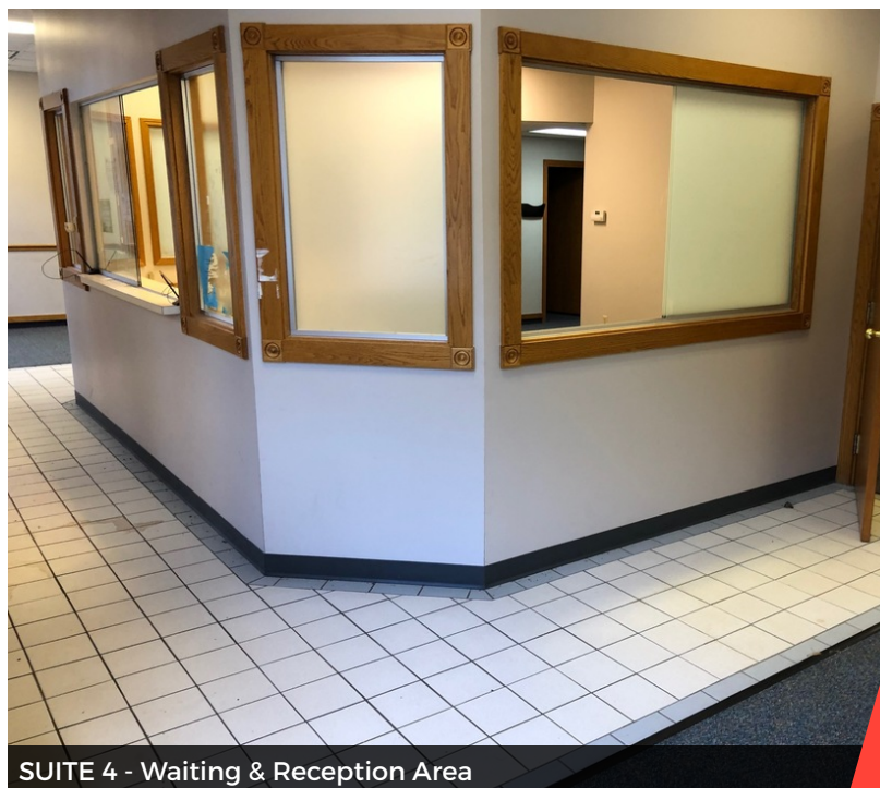
SUITE 4 - Waiting & Reception Area