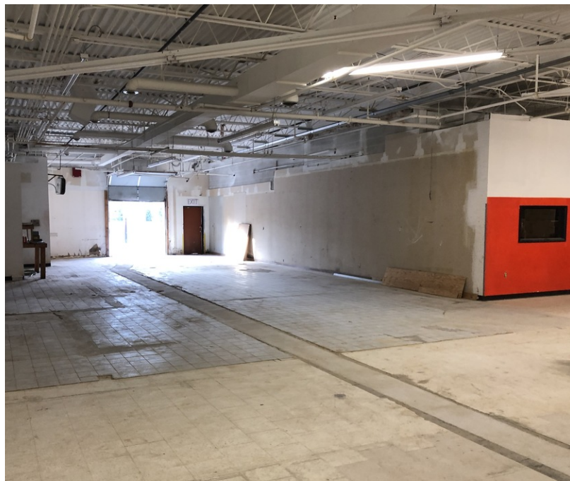
SUITE 3 - 8' x 8' Overhead Door