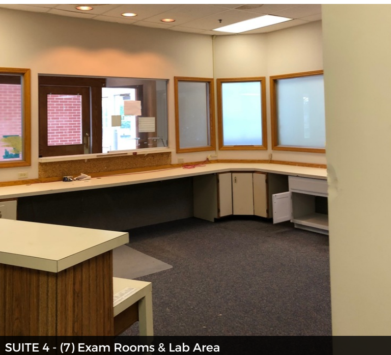
SUITE 4 - (7) Exam Rooms & Lab Area