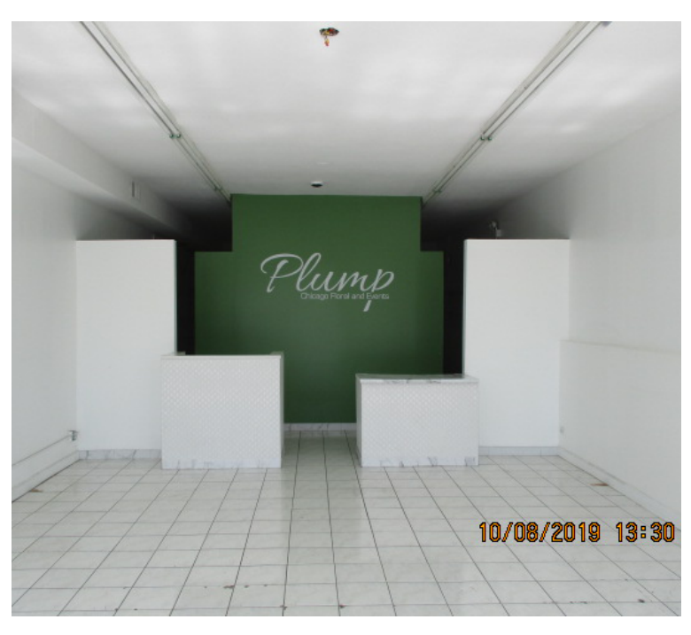
Unit 1836 - 1,360 SF