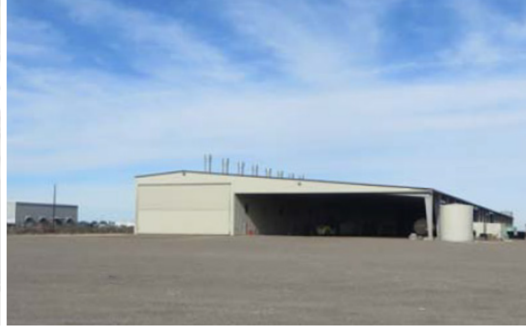
9504 W County Road 127 | Midland, Texas