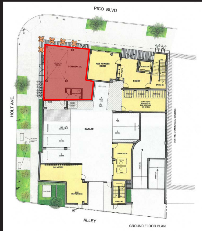
*Proposed 1st Floor Plan - Subject to Change

8590 PICO will feature 1,087 rentable square feet of ground floor retail space below 36 residential units at the corner of Pico Boulevard and Holt Avenue.