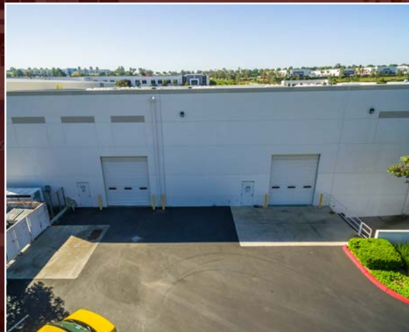
Good Truck Access