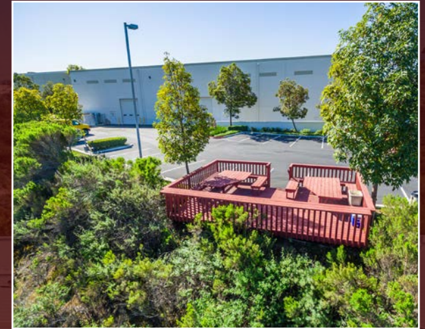
Deck Overlooking Open Canyon