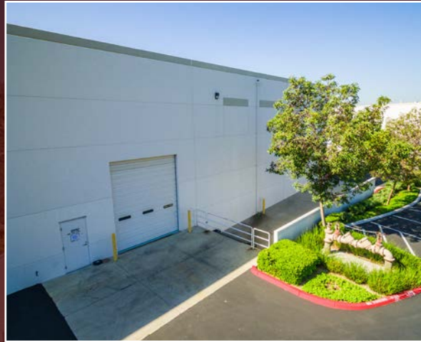
Dock High Loading