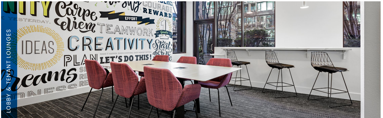
LOBBY & TENANT LOUNGES