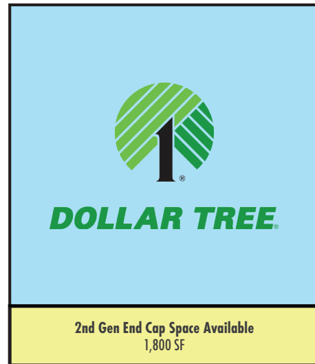
Building B: 11,500 SF