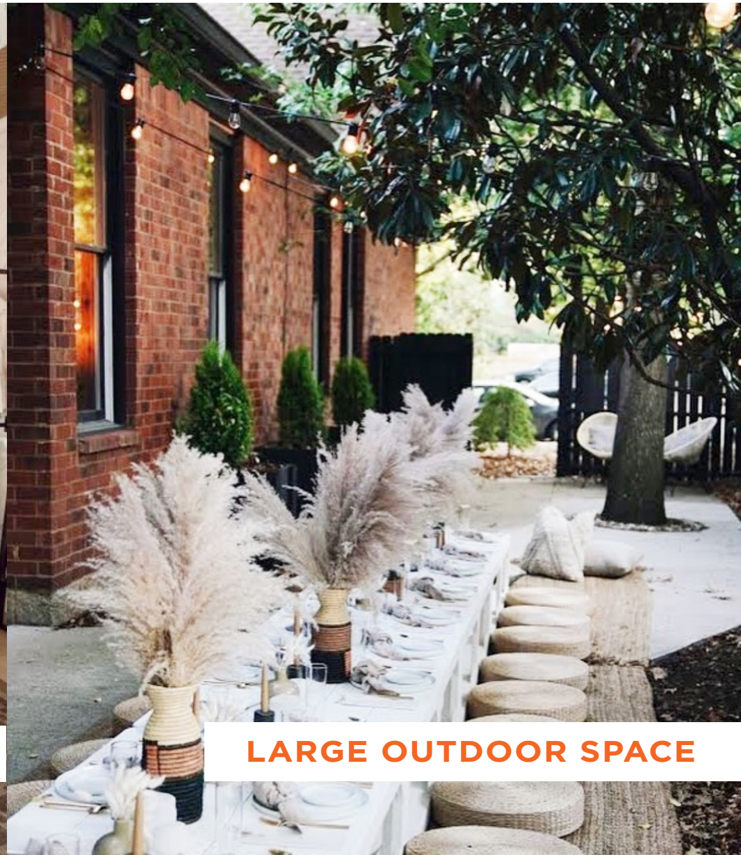
LARGE OUTDOOR SPACE