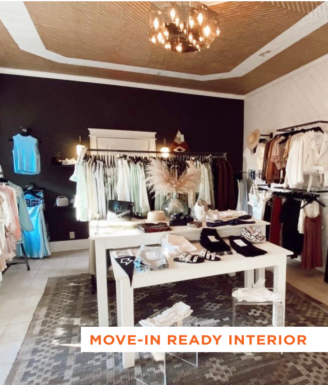
MOVE-IN READY INTERIOR