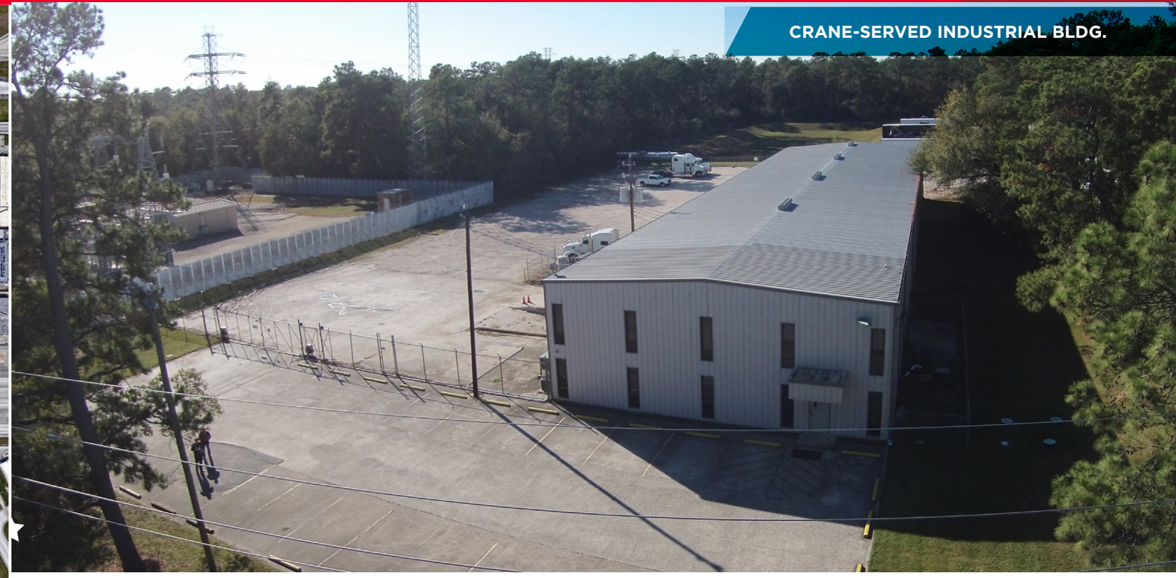
CRANE-SERVED INDUSTRIAL BLDG.