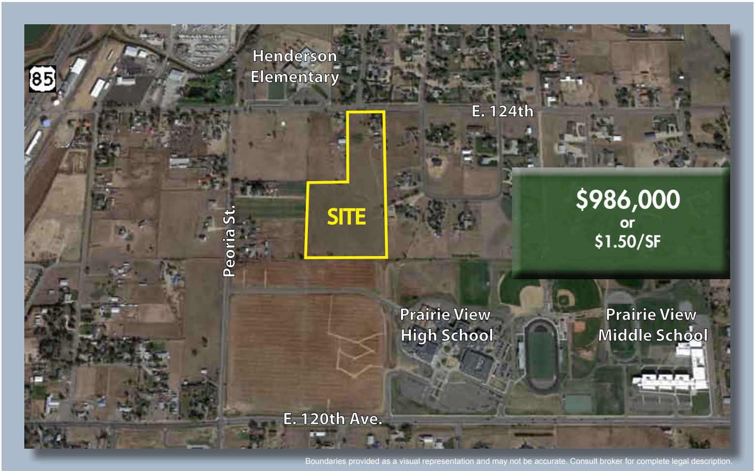
Boundaries provided as a visual representation and may not be accurate. Consult broker for complete legal description.

12480 E. 124th Avenue., Henderson, Colorado 80640