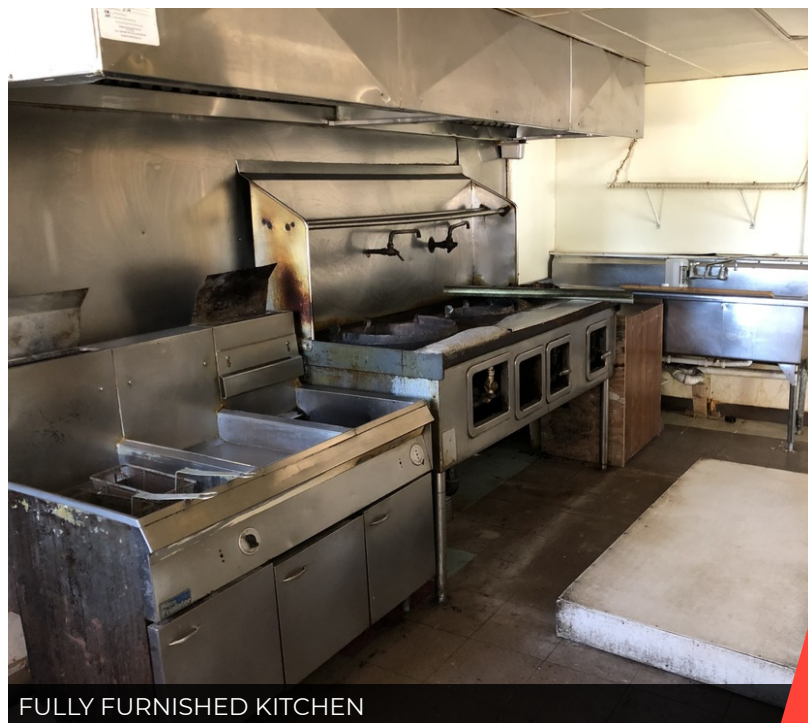
FULLY FURNISHED KITCHEN

KIENAN O'ROURKE 260.450.8443 korourke@xplorcommercial.com