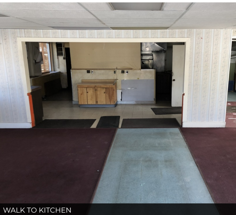
WALK TO KITCHEN