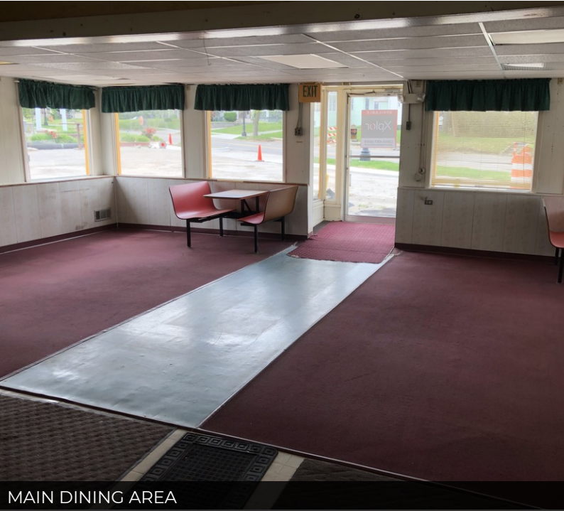
MAIN DINING AREA