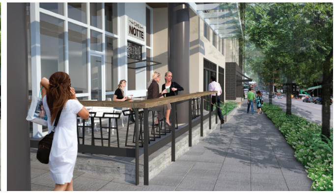
FAIRVIEW AND HARRISON RETAIL CORNER