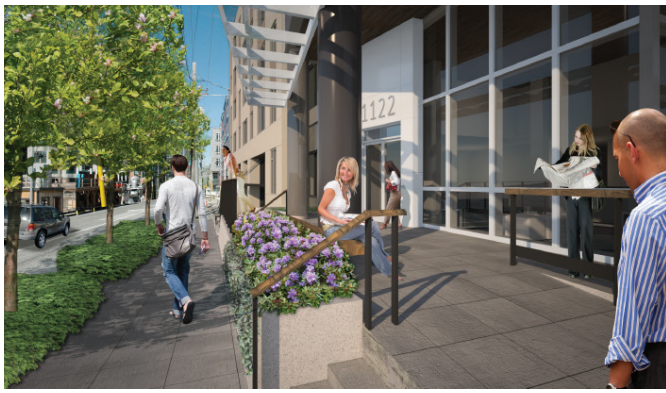
HARRISON STREET MIDRISE RESIDENTIAL ENTRY