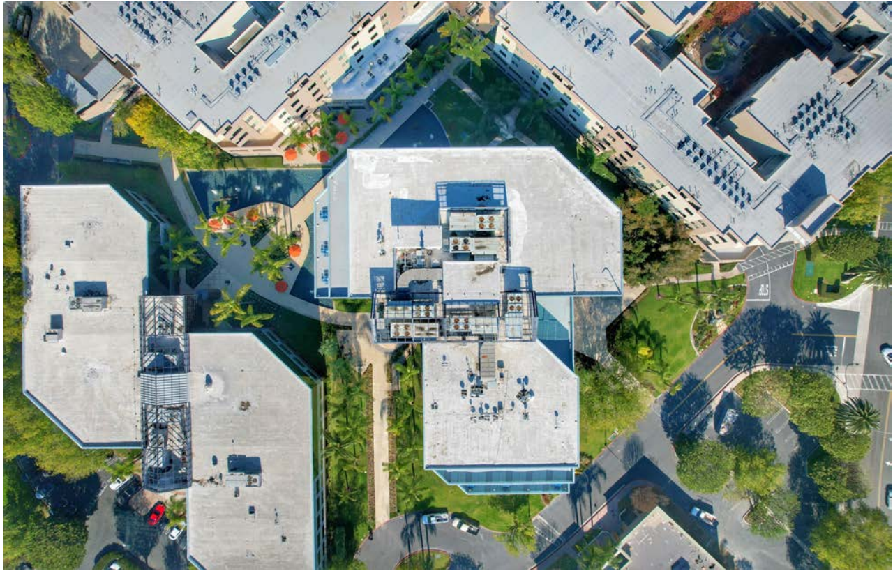
BUILDING AERIAL VIEW