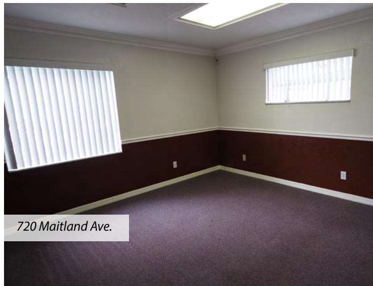
720 Maitland Ave.