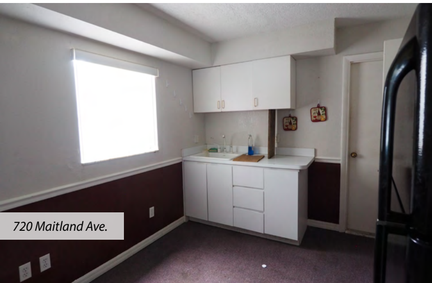
720 Maitland Ave.