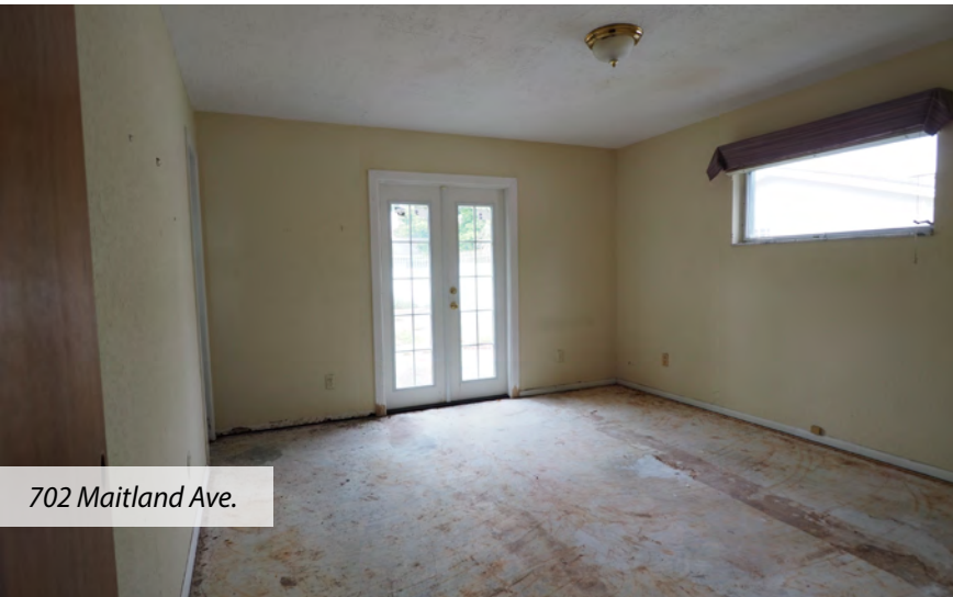
702 Maitland Ave.