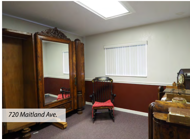
720 Maitland Ave.