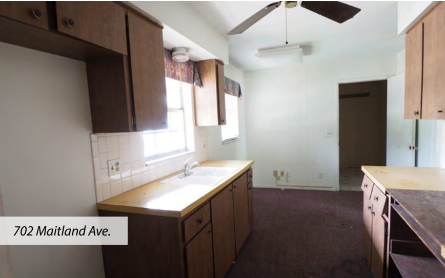
702 Maitland Ave.