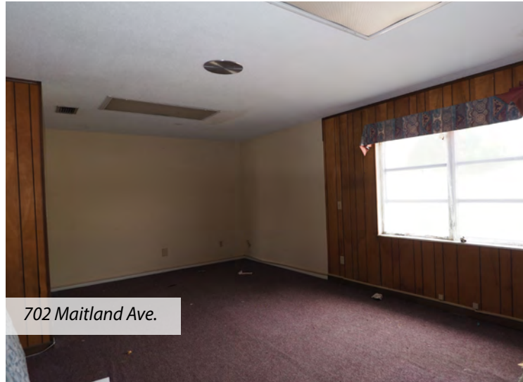
702 Maitland Ave.