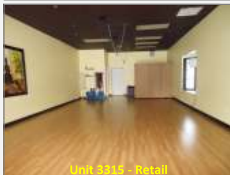
Unit 3315 - Retail