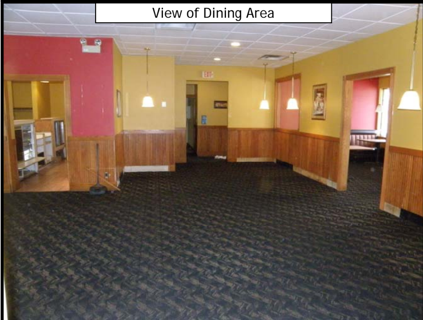
View of Dining Area