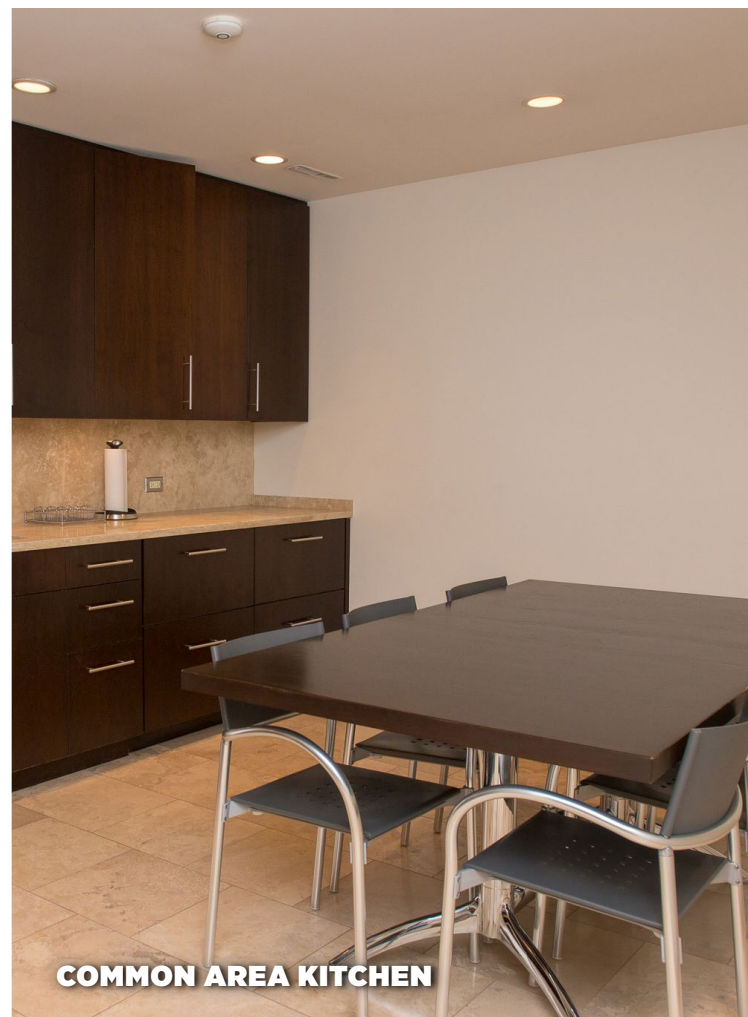
COMMON AREA KITCHEN