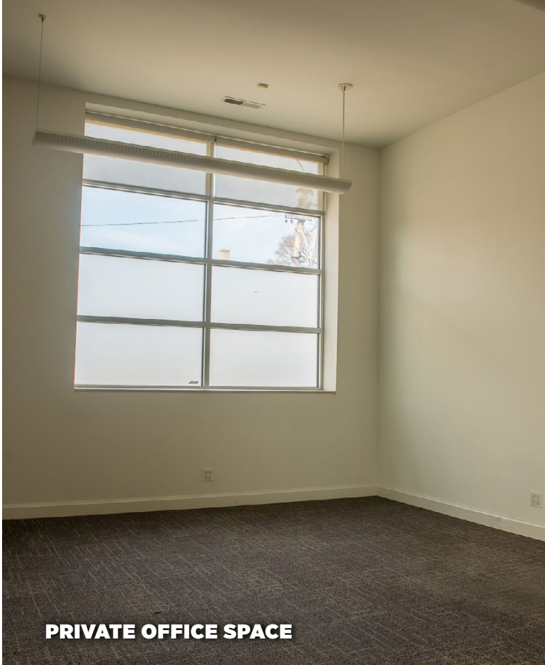
PRIVATE OFFICE SPACE