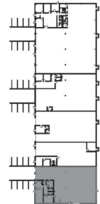
SUITE 5900F 6,000 SF ⊕