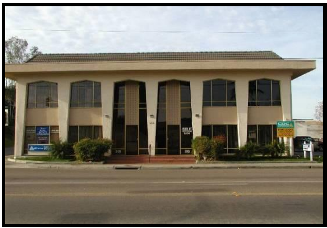
105 N Rose Escondido, CA