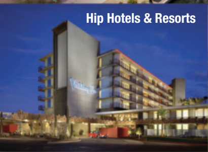
Hip Hotels & Resorts

Central Scottsdale is the affluent residential and business hub in Scottsdale, with master-planned communities such as Gainey Ranch, McCormick Ranch and Scottsdale Ranch, that have thousands of residents, as well as 200,000 employees within five miles. Our site is located on the reservation near the 496-room Talking Stick Resort, Top Golf and the Salt River Fields sports complex. These projects surround one of the larger retail projects in Scottsdale, the 950,000-square foot Pavilions shopping center located at the Loop 101 and Indian Bend Road.