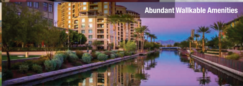
Abundant Walkable Amenities