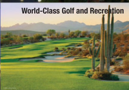
World-Class Golf and Recreation