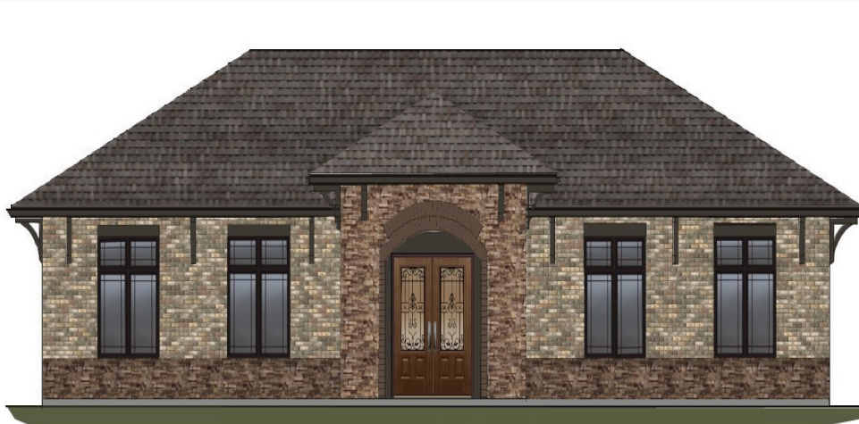
Executive I (Two units available)

Office building with storage & drive-in access