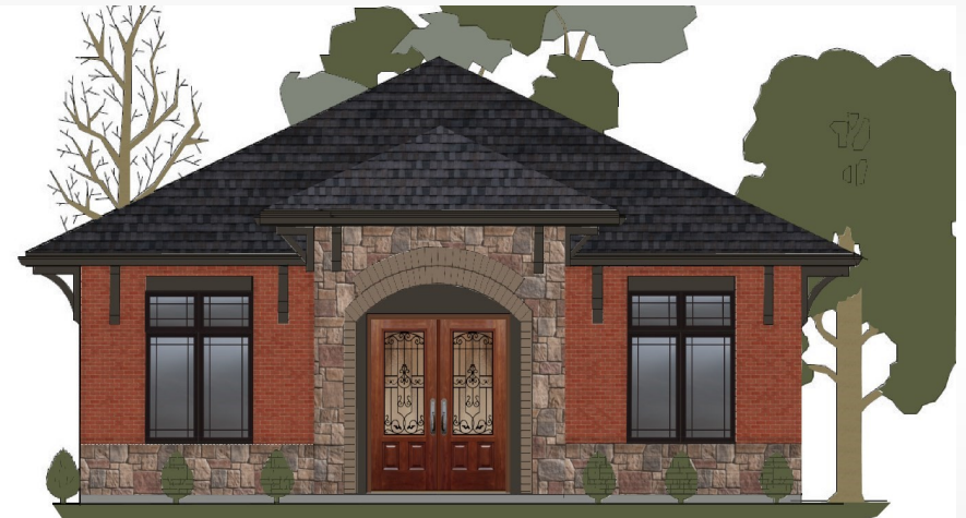
Executive II (Four units available)