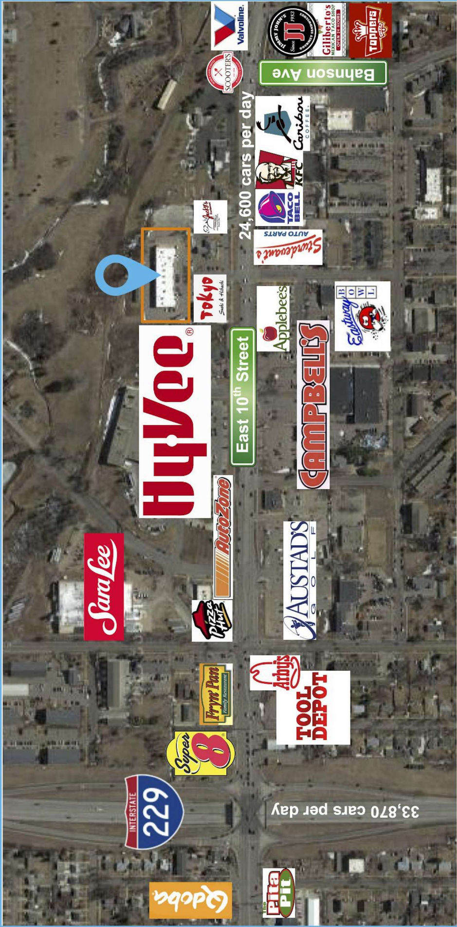
East 10th Street Retail Map