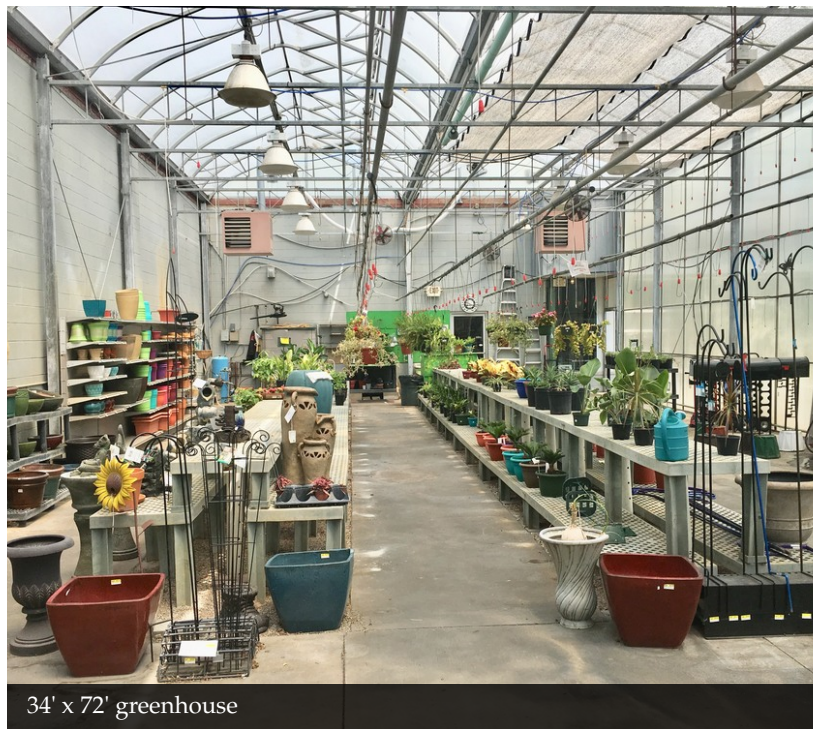
34' x 72' greenhouse